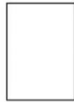
STORAGE CAGE 1.7 x 1.2m