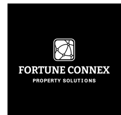
Rental Fortune Connex 0480100267