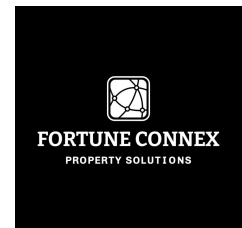
Rental Fortune Connex 0480100267