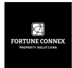
Rental Fortune Connex 0480100267