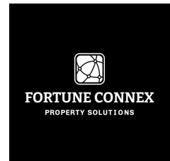
Rental Fortune Connex 0480100267