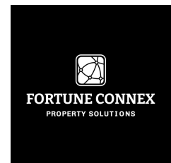
Rental Fortune Connex 0480100267