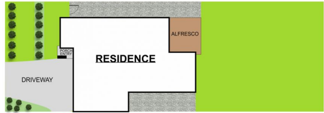
Site Plan Not On Scale