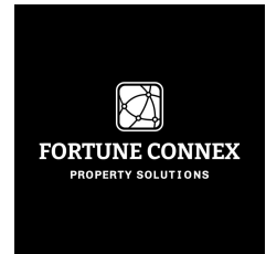
Rental Fortune Connex 0480100267